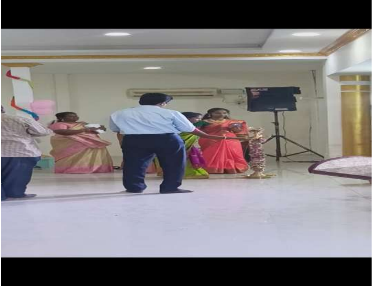
Lighting Kuthuvilakku by Chief Guest