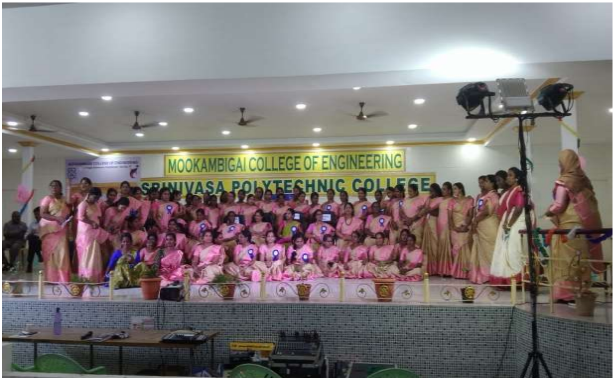
Faculty of MCE and SPT with Chief Guest