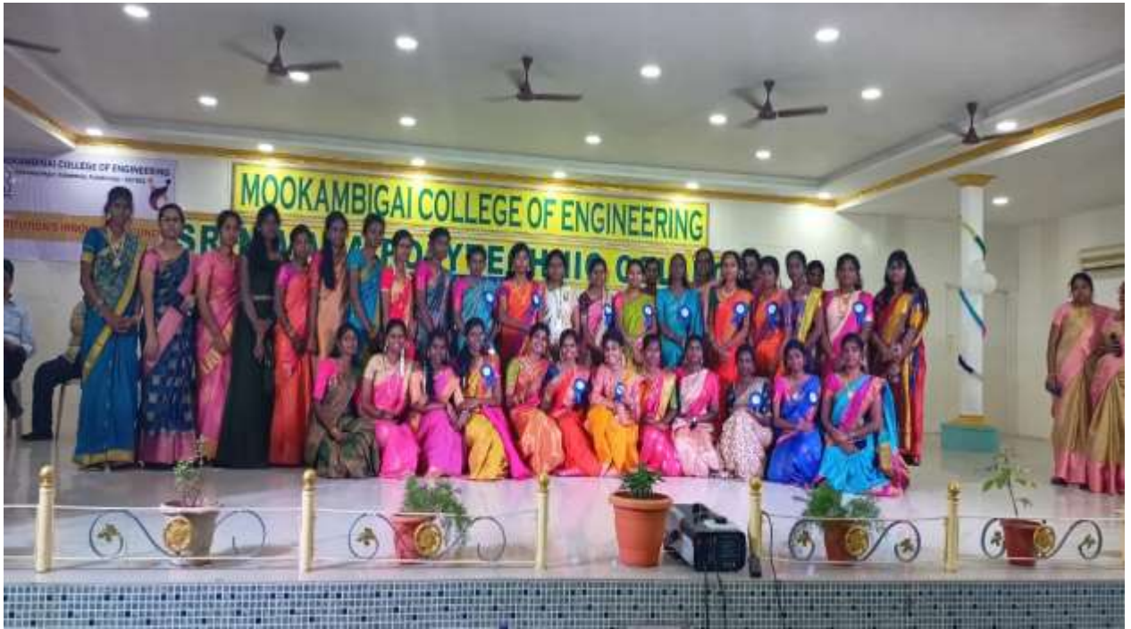
Final Year Students with Chief Guest