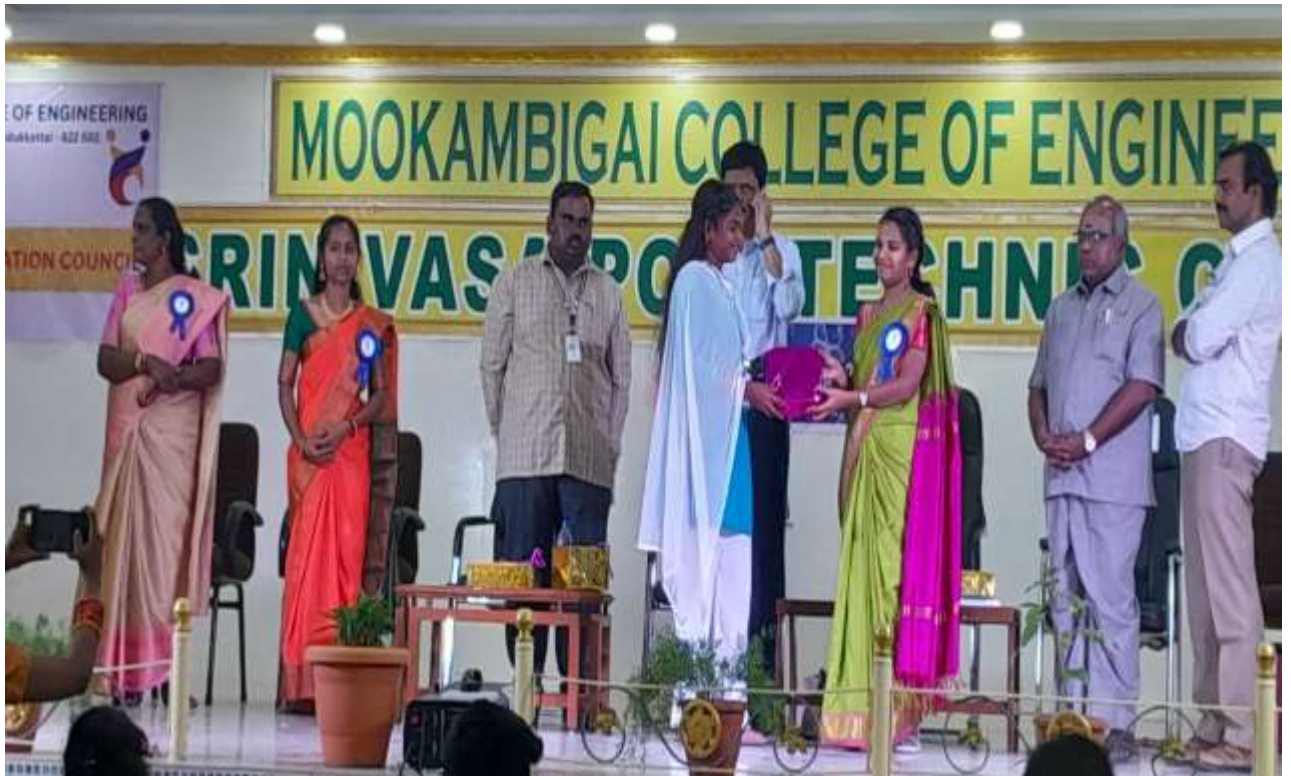
Prize Distribution to Students By Chief Guest