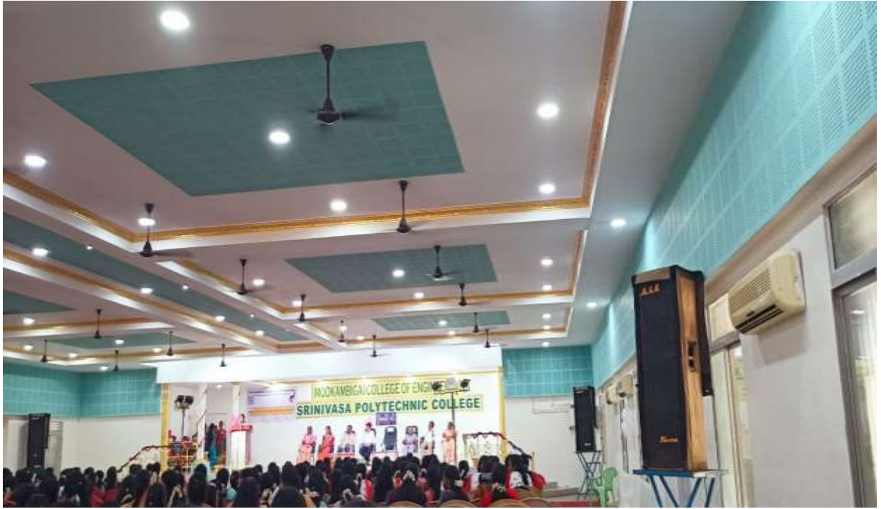
Chief Guest Speech